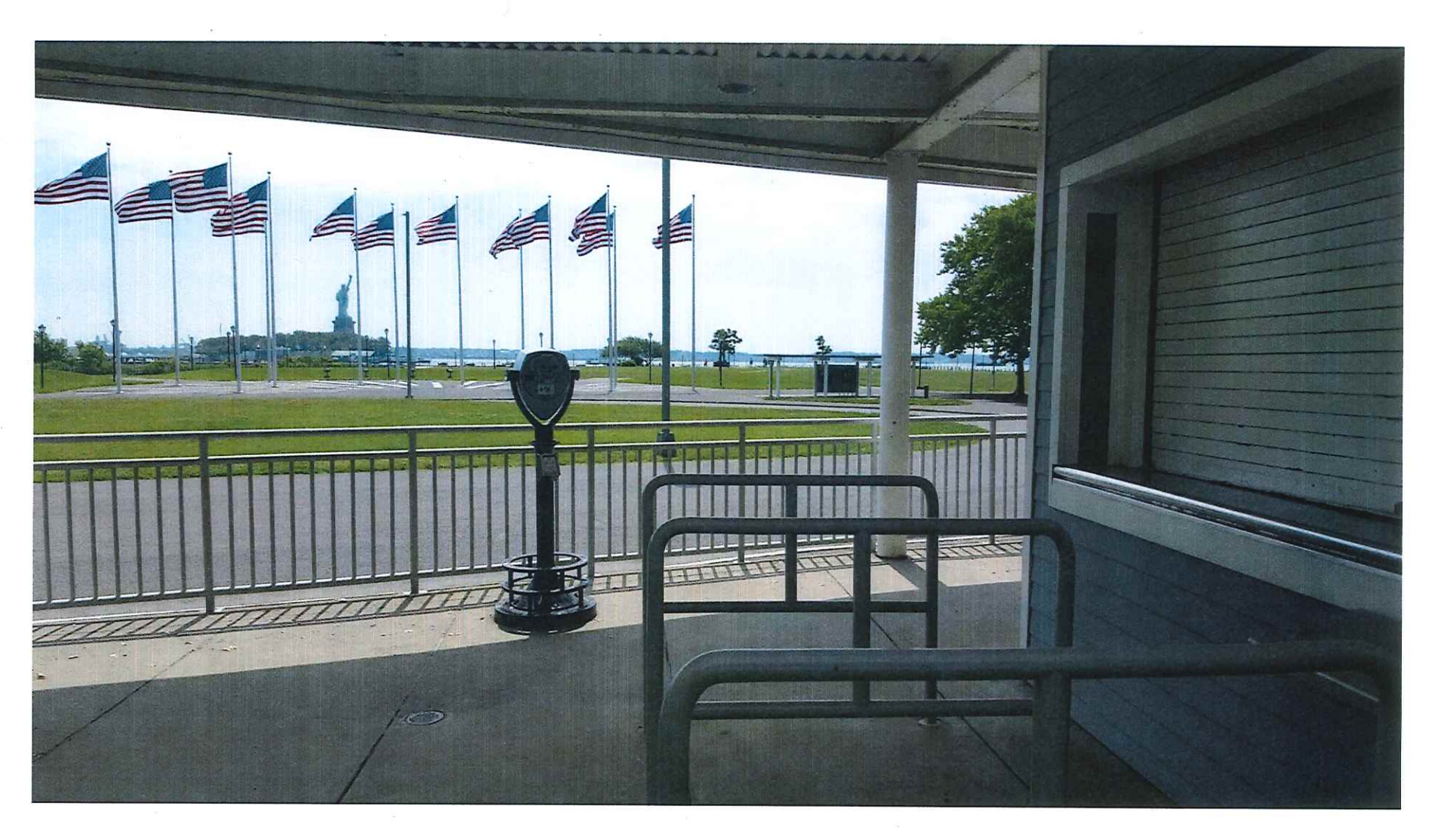
View looking East of Concession Stand